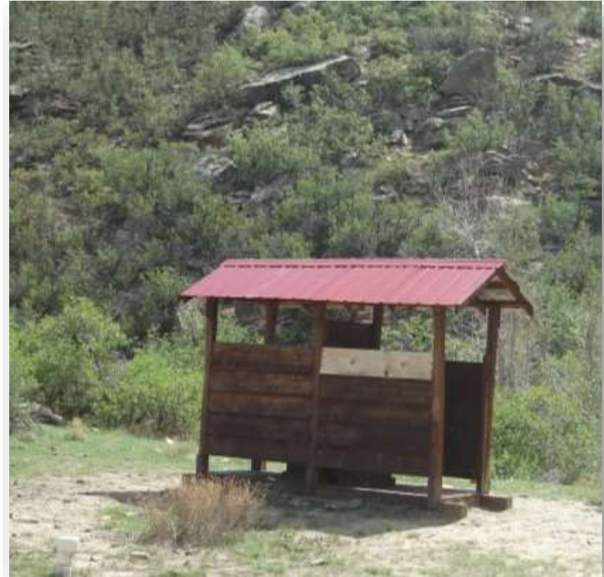
Red Roof Inn