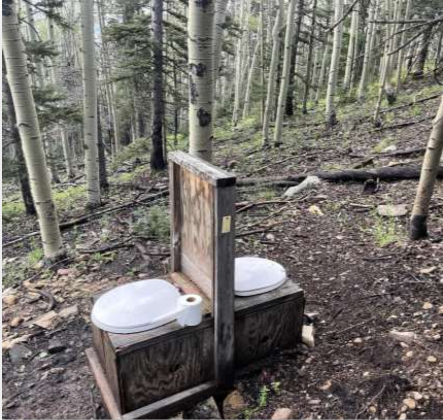
Pilot to Bombardier